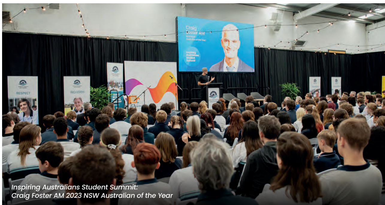
Inspiring Australians Student Summit: Craig Foster AM 2023 NSW Australian of the Year

The event featured performances from the St Peters College band, Elder Conservatorium Chamber Chorale, and the Balinese Society of South Australia, showcasing South Australia's diverse talent and cultural identity.